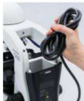
Cable storage compartment