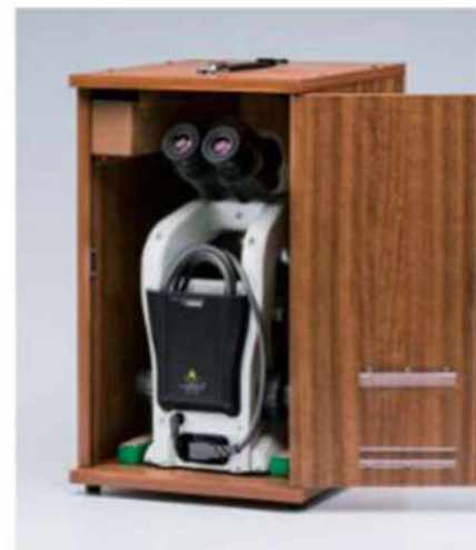
Dedicated wooden case (optional)