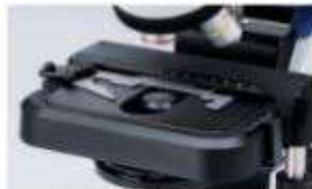
Rackless stage and stage cover