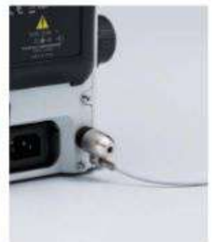
Built-in security slot