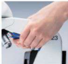
Ergonomic grip for easy carrying