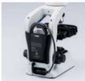
Convenient and easily accessible power cable storage