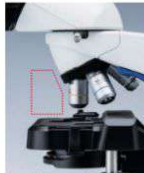
Inward-facing revolving nosepiece