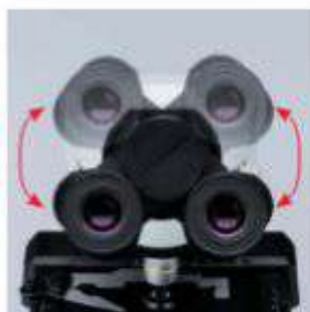
Eyepoint height adjustment