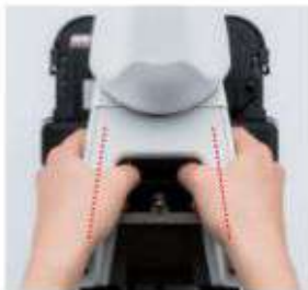
Angled arm enables comfortable carrying