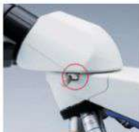
Locking pin for easy binocular rotation